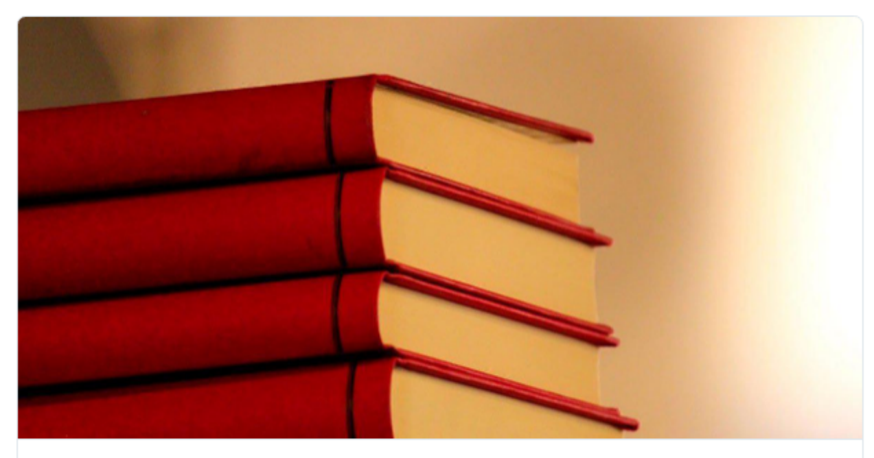
Algerian geography books withdrawn after labelling Palestine as Israel

The Algerian Ministry of Education ordered the 'immediate' withdrawal of a secondary school geography book yesterday, due to a printing error that labelled... middleeastmonitor.com