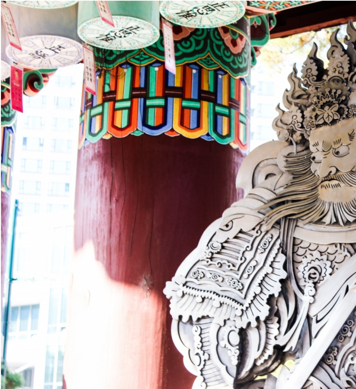
A guardian of Jogyesa Buddhist Temple in Seoul; he is placed at the gates to this temple.

exploitation of nationalist rhetoric by politicians.