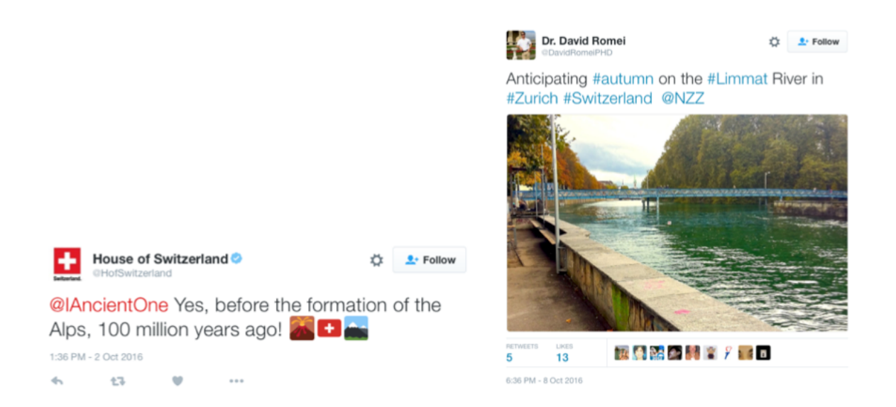
Figure 1. Sample tweets from the @HofSwitzerland and #Switzerland data sets.

Our data analysis focused on two types of values: texts and links. RQ1 and RQ2 are posed to better explain the interactions with actors regardless of the content of the interaction. We solely focused on social network analysis measures—mainly centrality and modularity measures—to explain the structure of the networks. Two sample tweets—one from the @HofSwitzerland data set and one from the #Switzerland data set—are shown in Figure 1. The instances of interactions between @IAncientOne and @HofSwitzerland and between @DavidRomeiPHD and @NZZ are included as a link.